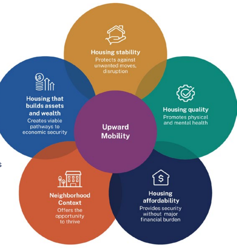
*As defined by the US Partnership on Mobility from Poverty as economic success, power and autonomy, and being valued in community.

A growing body of evidence shows the vital link between children's success in school and the housing bundle, i.e., the five-part framework housing advocates say is essential to upward mobility: housing quality, housing affordability, housing stability, neighborhood context, and housing that builds assets and wealth. Securing housing supports for lower-income families with school-aged children is a challenge, given that only about one in four households whose income qualifies them for federal housing assistance can access it. That challenge is even greater for undocumented or mixed-status immigrant families, who may be ineligible for, or fear, accessing government subsidies, resulting in housing instability.