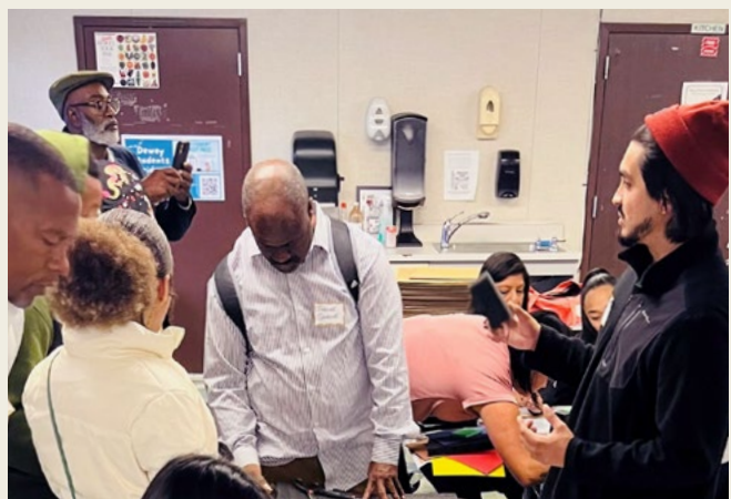
Oakland, Calif.-based TAY, including young people with lived experience of housing insecurity, participated in charrettes, informing the design and planning of the Career and Technical Education TAY Hub.

Concurrently, there is a large advocacy coalition based in the city of Oakland, in California's Alameda County, that is pushing for a more connected and expansive TAY support system. Each year, approximately half of Oakland Unified School District graduates do not enter post-secondary programs. The coalition is centered around a place-based intervention that brings together housing and education partners. They hope it will lead to a transformation in how Oakland's TAY housing assistance system operates. Known as the Career and Technical Education TAY Hub (aka "the CTE TAY Hub"), the project seeks to leverage property owned by the public school district to develop a center for TAY housing, educational, social and employment opportunities. Through the generous investments of local private foundations, paid youth advocates have been critical to the CTE TAY Hub's planning. This includes addressing what happens to TAY who graduate from the time-limited housing services offered, and identifying resources for TAY who will not be able to access the CTE TAY Hub's housing services because of finite space.